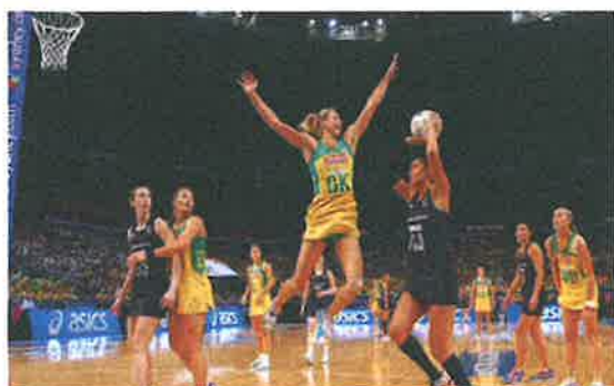
Great for the joints, by Liz Ellis.